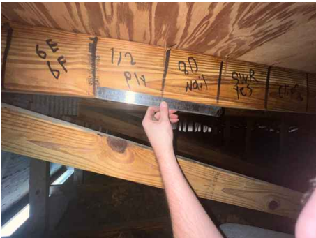
Spacing and Information