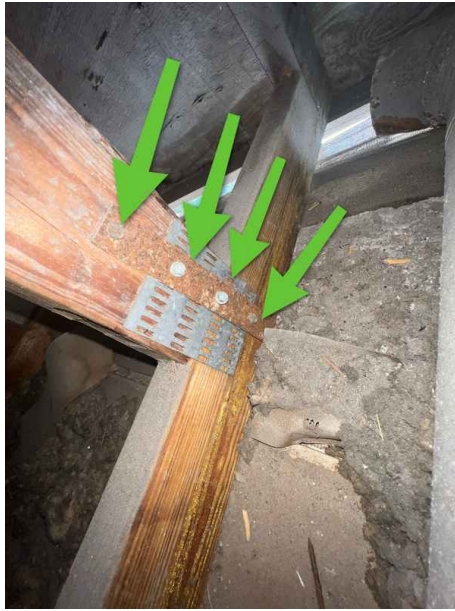
Clips 3 Nails

Inspectors Initials AS Property Address 614 Guild Dr, Venice, FL 34285